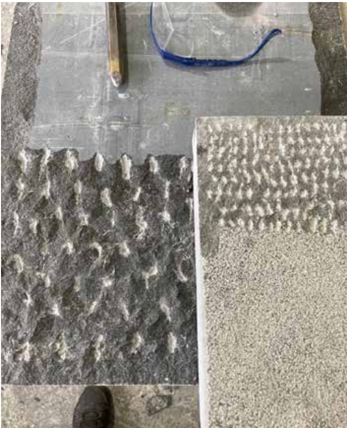
Production phase. The 3 different levels of hammering